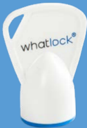
Key x 1